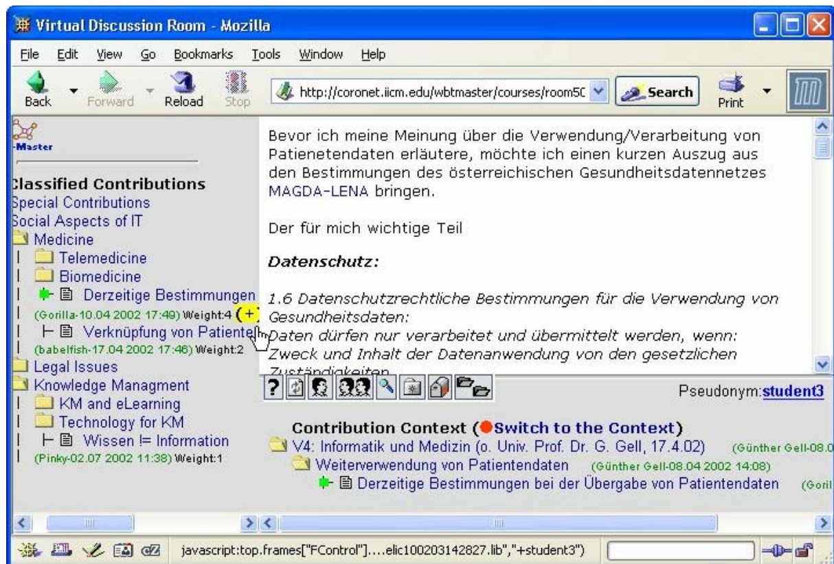
Figure 1: Voting mechanism for classification of contributions

The category structure and the contribution assignments are then utilized to improve search and navigation facilities. In addition, the predefined taxonomy might be altered on-the-fly, i.e. the taxonomy is flexible in the sense that it can be extended, the categories can be modified and deleted by the users of the system. In a sense it is a similar approach to the concept of “folksonomies” with the difference that it takes more of a top-down approach (a session is started with a predefined taxonomy) and the relations between categories are always hierarchical.